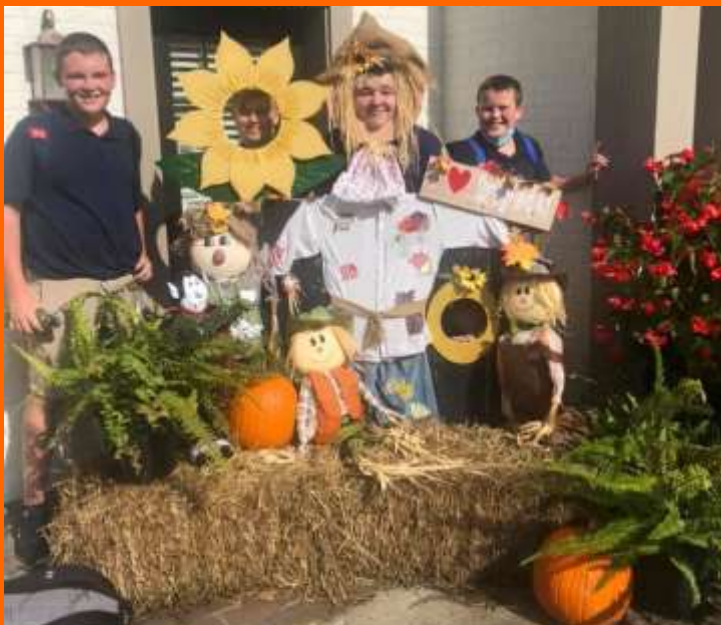
Another photo op, this one in downtown Springfield.

Get to the Market tomorrow in Paducah for one last shopping trip with area farmers!